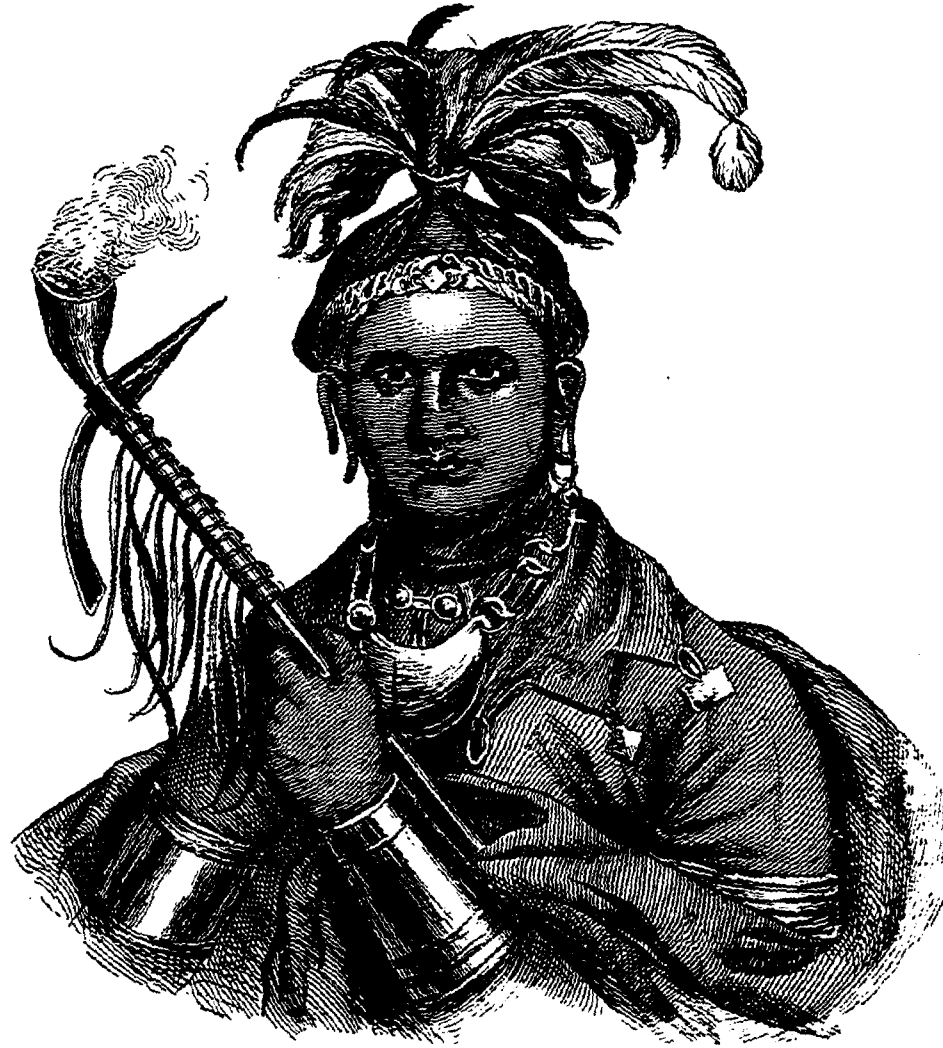
CORN PLANT, KI-ON-TWOG-KY.

to you some circumstances that occurred after the war. General Putnam, who was then at Philadelphia, told me there was to be a council at Fort Stanwix, and the Indians requested me to attend on behalf of the Six Nations, which I did,