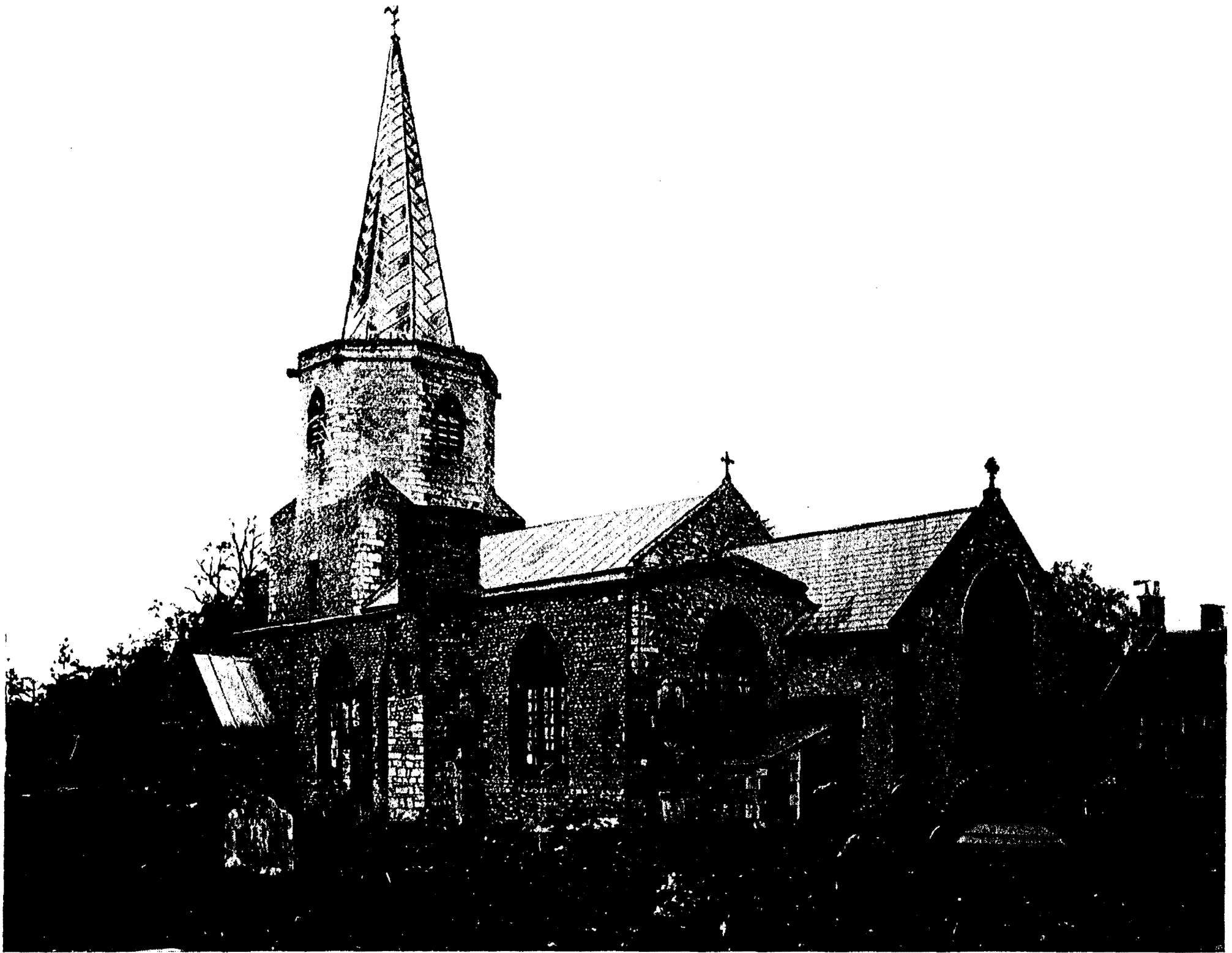
CHURCH AT PITMINSTER, SOMERSET, ENGLAND.