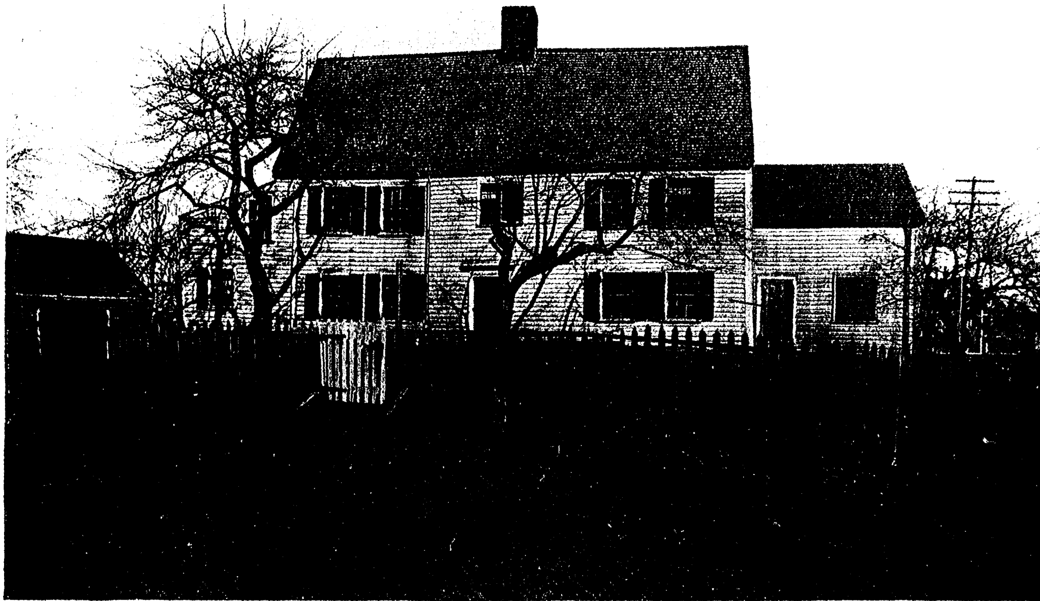
THE BLAKE HOUSE, DORCHESTER, BUILT 1650.